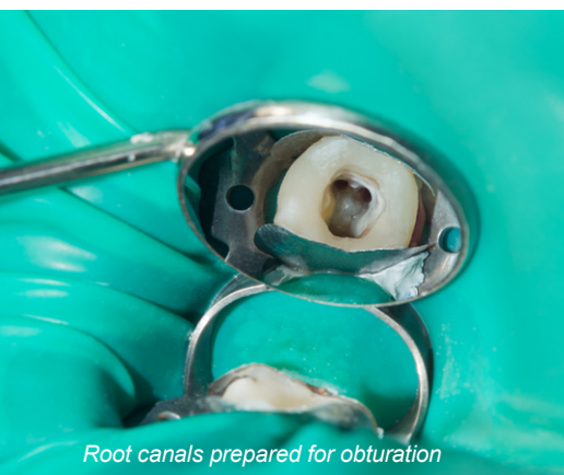
Root canals prepared for obturation