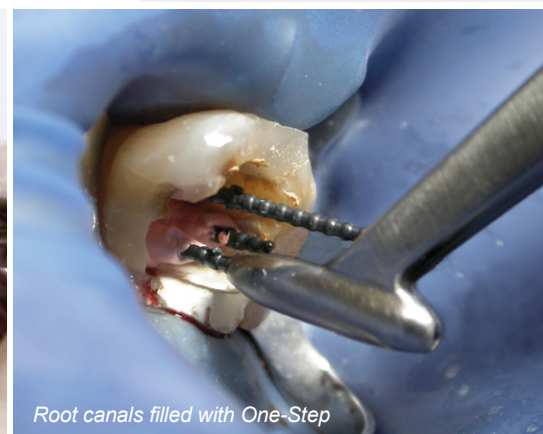
Root canals filled with One-Step