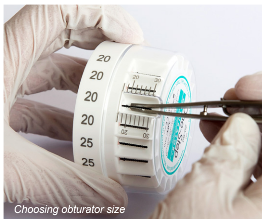
Choosing obturator size