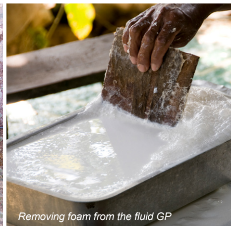
Removing foam from the fluid GP