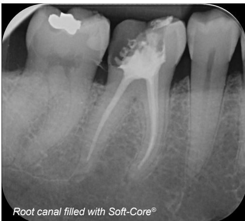
Root canal filled with Soft-Core®

With Soft-Core® you are sure to make the perfect apical seal.