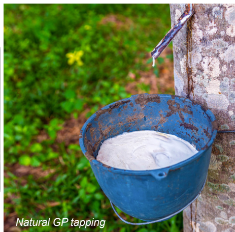
Natural GP tapping